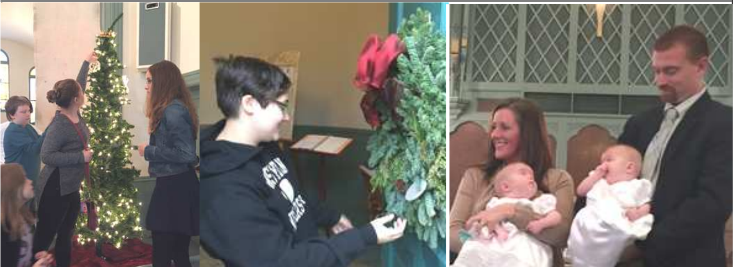
HANGING OF THE GREENS 2015