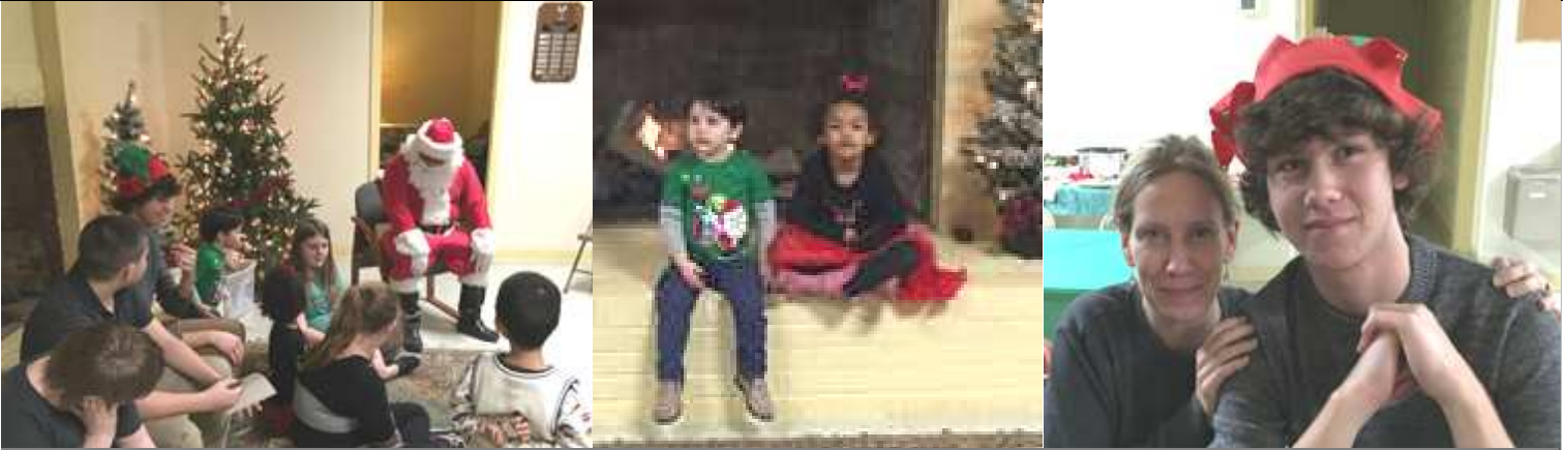
CHRISTMAS PARTY 2015