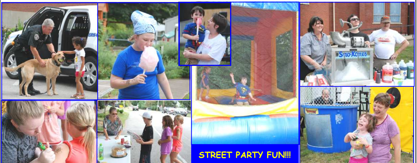
STREET PARTY FUN!!!