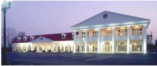
Claudia Sanders Dinner House

On Thursday, August 27th, Keenagers will travel to Claudia Sanders Dinner House for lunch at 11:30 a.m. Please RSVP to the church office by Monday, August 24th if you can go. Meet at church by 10:45 a.m. to carpool.