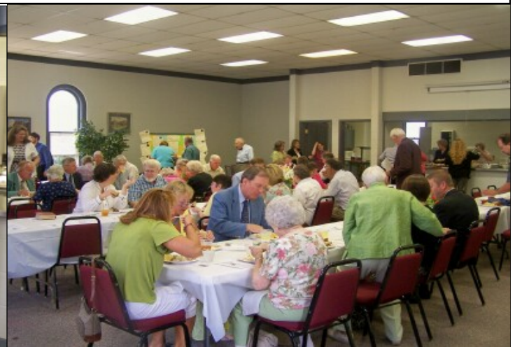
Everyone enjoyed lunch at the 165th Anniversary Celebration on Sunday, July 26, 2009.