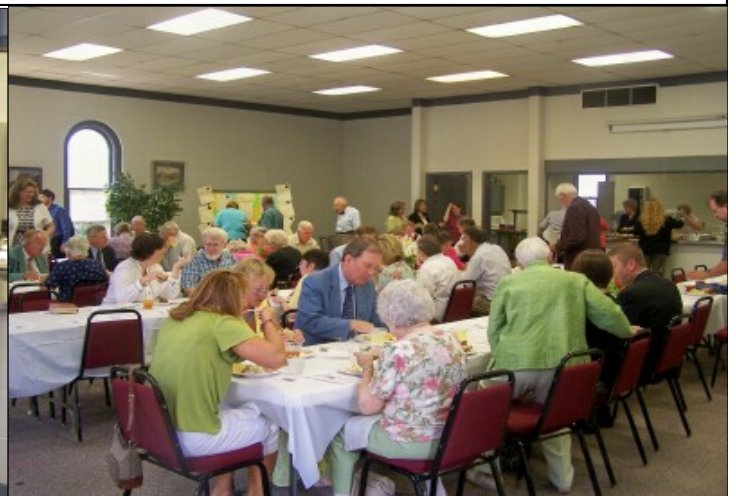
Everyone enjoyed lunch at the 165th Anniversary Celebration on Sunday, July 26, 2009.