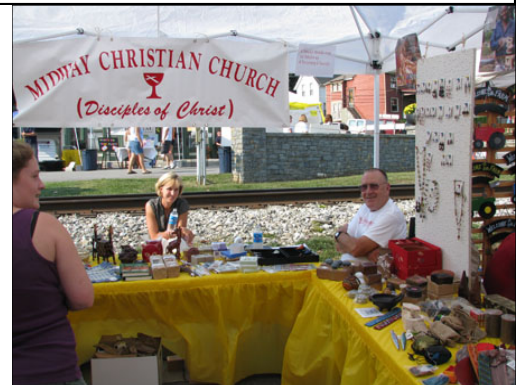
The Midway Christian Church Booth at the Midway Fall Festival filled with items from Ten Thousand Villages