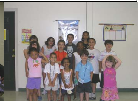
Vacation Bible School